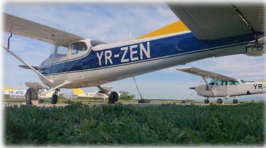
TECNAM P2008 MK II